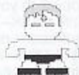
TERRY MAN Bulldogging Headlock